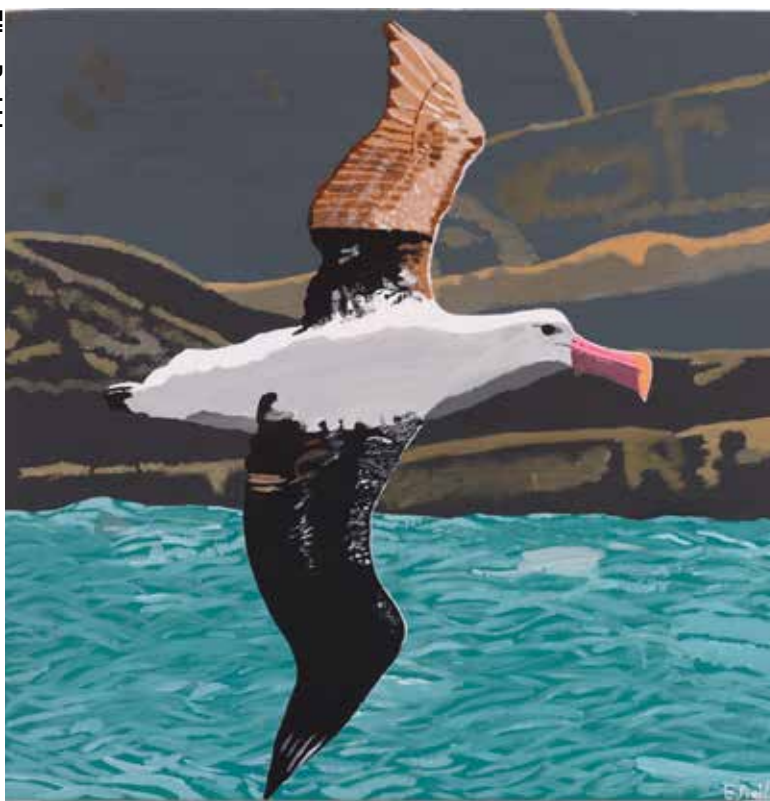
Ellen Prebble, Albatross, 2021

versations. Inclusion is about having conversations with people. Sometimes they can be challenging and it can be things you don't want to hear. But actually, being inclusive is about embracing lots