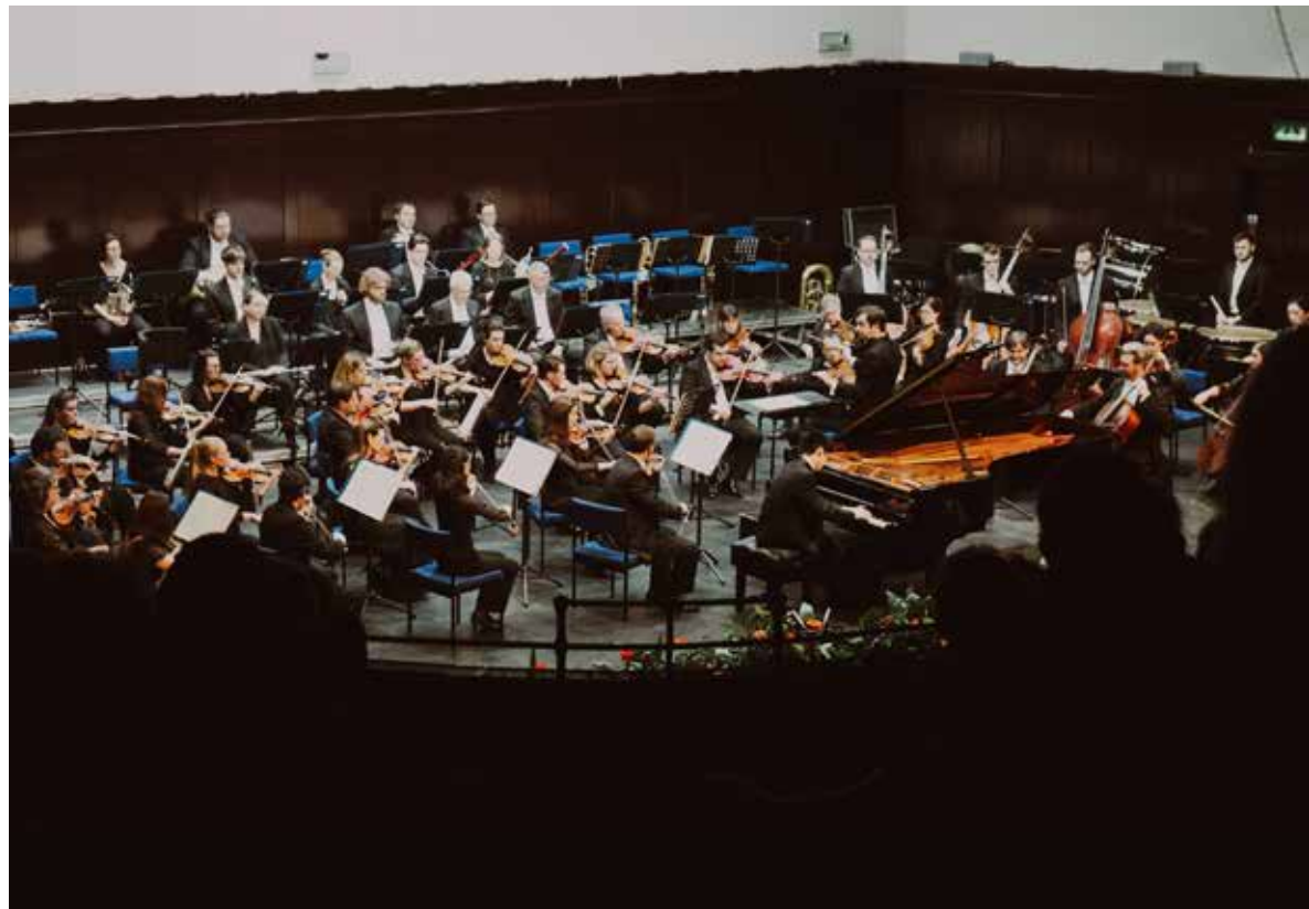
Hastings International Piano Competition

For the first time, the Southbank Sinfonia – a chamber orchestra that is formed anew each year by the recruitment of 33 promising music graduates – will accompany the 10 semi-finalists in the classical concertos they choose, and the full forces of the Royal Philharmonic Orchestra will play once again for the five final-